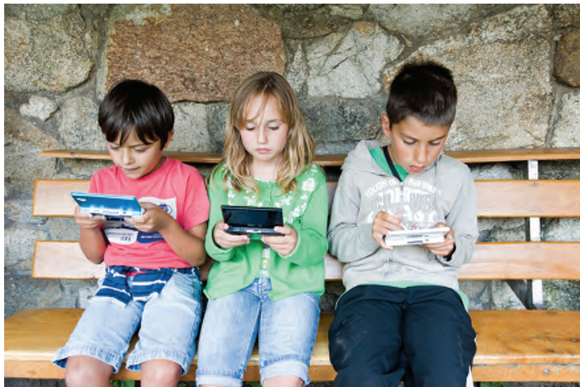
Children playing on Nintendo DS handheld games console, Spain